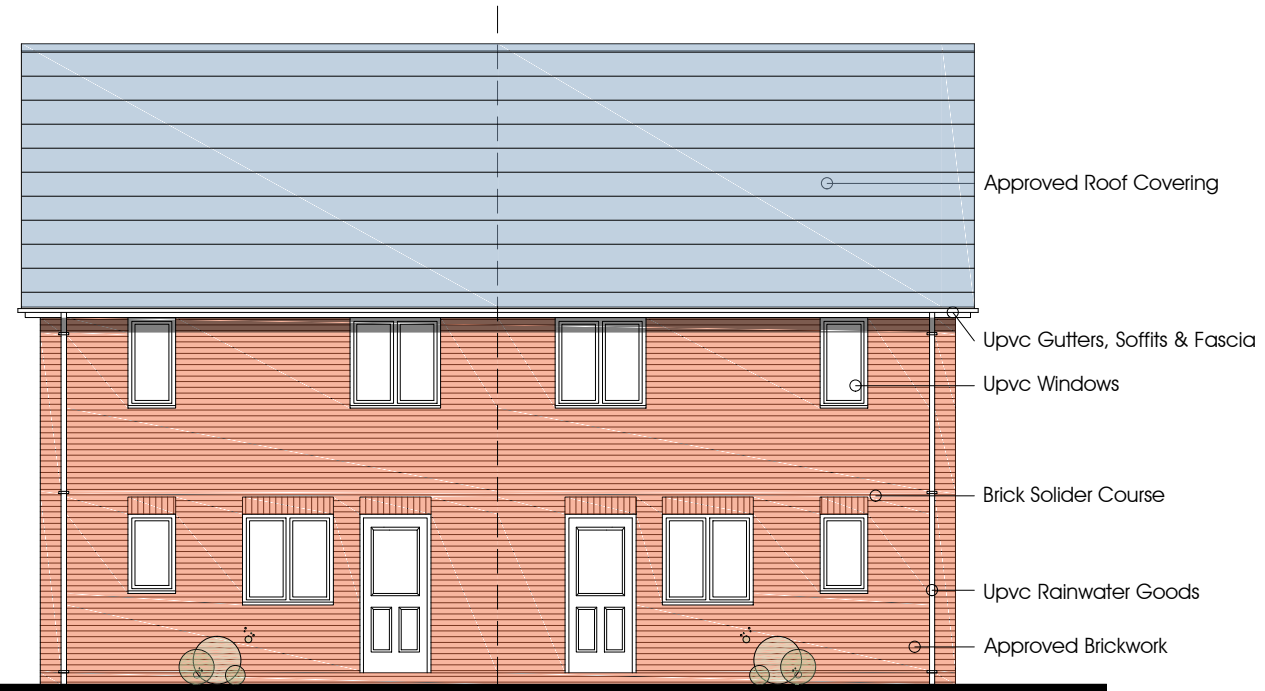
REAR ELEVATION Typical 2 Bed House