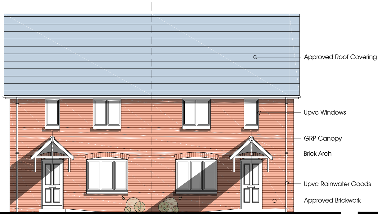
FRONT ELEVATION Typical 2 Bed House